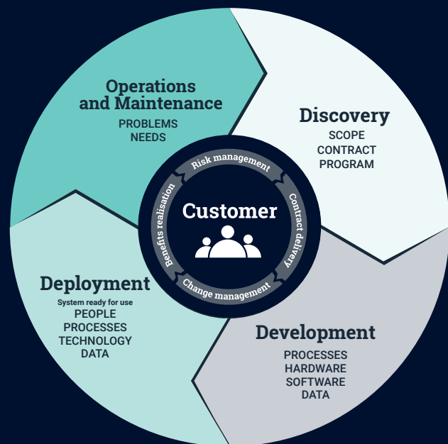
HIGH-LEVEL SYSTEMS METHODOLOGY MODEL

Transmax employs 150 people who work in dedicated teams to manage our customers' requirements.